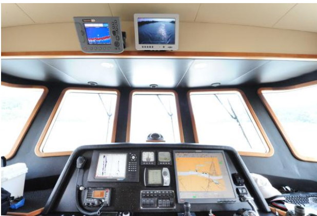
Pilot house electronics/navigation