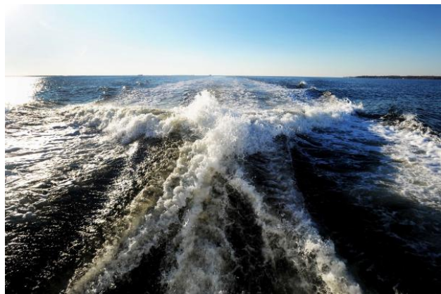
Full speed ahead