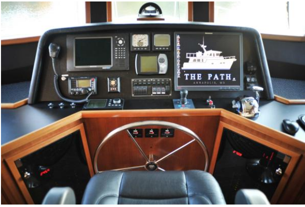
Pilot House steering station