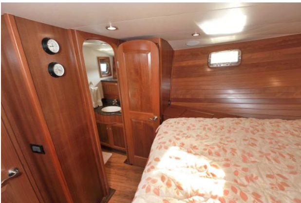
Stateroom head and shower