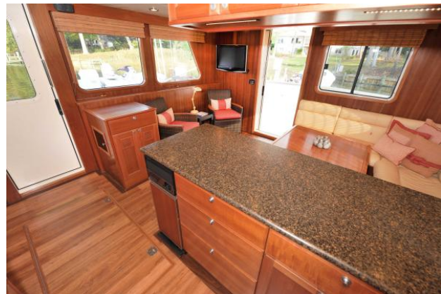
Door to cockpit and side entrance doors