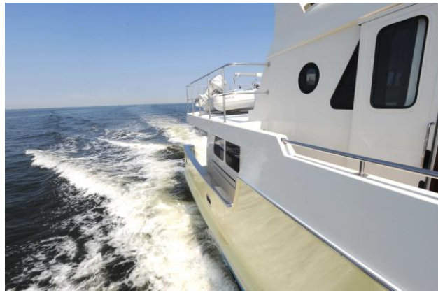
Beautiful day on the bay