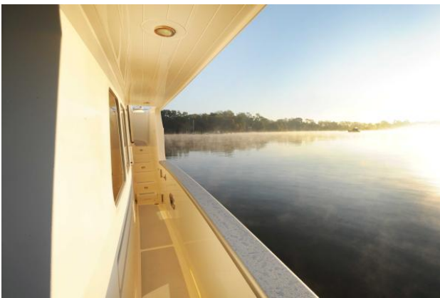
Wide walk around