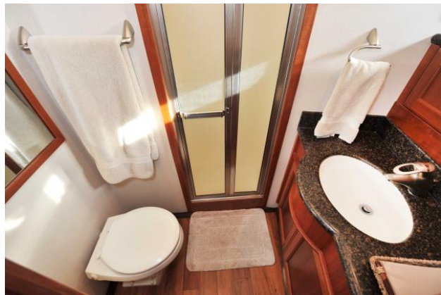
Owners head & shower