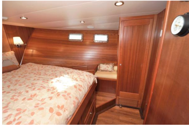
Fwd. Owners stateroom