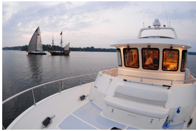
on the Chesapeake