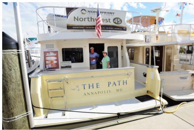
Annapolis boat show