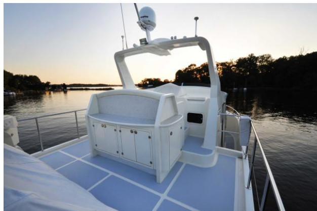
Huge bridge deck