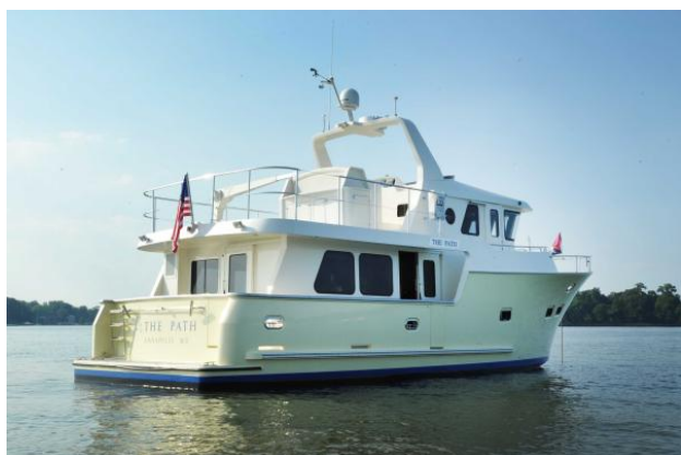
On the hook