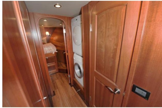
Looking fwd. to Master