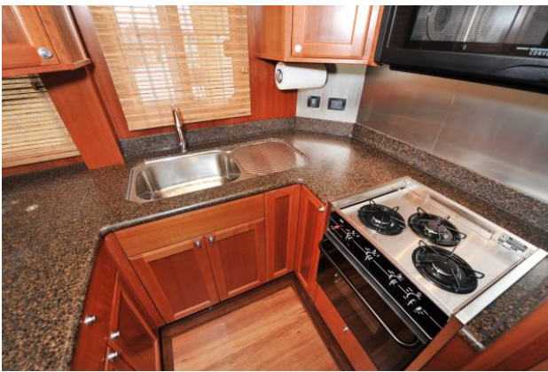
U shaped galley