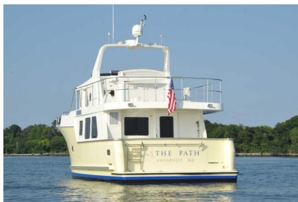
On the hook