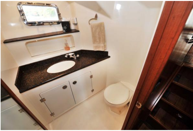
Head & shower