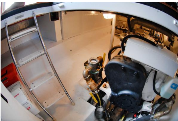
Down to engine room