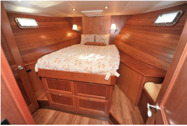
Walk around Queen berth