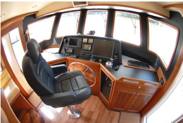
Lower steering/pilot house