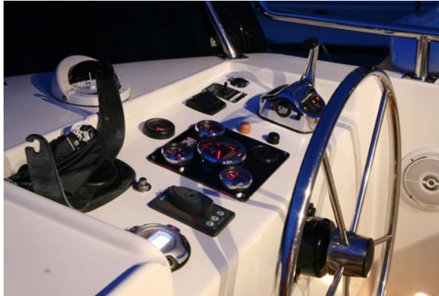
Optional Upper Helm